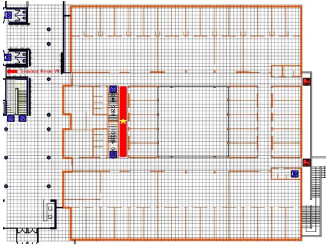
Fig. 4. The floor plan for Mark

James should be alerted about the RDFConcept presentation. The next step is to localize Mark and James using the Location Sensing component in order to deliver the appropriate floorplans. Figure 4 presents the floorplan that will be created for Mark. In the floorplan, the cell that Mark is located at is filled with red, and Mark's current position is denoted by a star. Additionally, the position of the Seminar Room VI is described by a red arrow pointing at the entrance of the room, followed by the name of the seminar room. Finally, the system creates and sends the appropriate e-mail notifications to them.