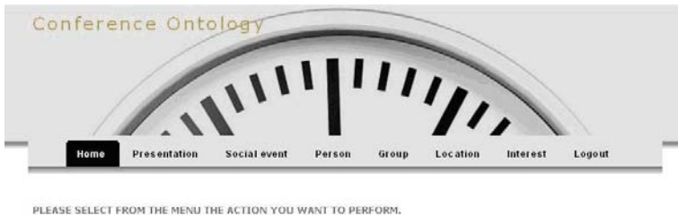
Fig. 3. User Interface

The UserInterface constitutes the interaction means between the users and FlexConf (see Figure 3). The UserInterface does not require any specific software; it is a web application, and thus is accessible through any web browser. FlexConf identifies and supports two types of users; common users and system administrators. Through UserInterface , a common user may import or update information about personal preferences and groups memberships. He can also have access to the conference program and view details about specific events. Finally, he has the option to disable alerts, so that the system does not include him in the list of the potential notification recipients, and stops positioning him in the